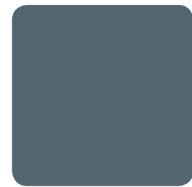
Black Velvet (2)